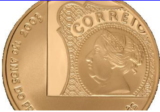
“150 Years of the First Portuguese Stamp” coin

Prize in the XXIII the Conference of the Mint Directors (MDC - Mint Directors Conference), San Francisco (U.S.A.), for the technically more advanced coin in the category of commemorative coin, in gold proof, of the years of 2002 and 2003.