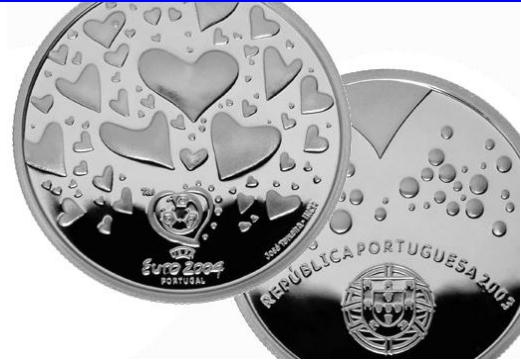
“Football is Passion” coin

Prize in the XXIII the Conference of the Mint Directors (MDC - Mint Directors Conference), San Francisco (U.S.A.), for the technically more advanced coin in the category of commemorative coin, in gold proof, of the years of 2002 and 2003.